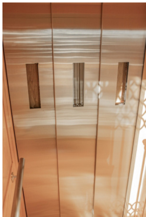
Shown in Brushed Stainless Steel with Vision Panel