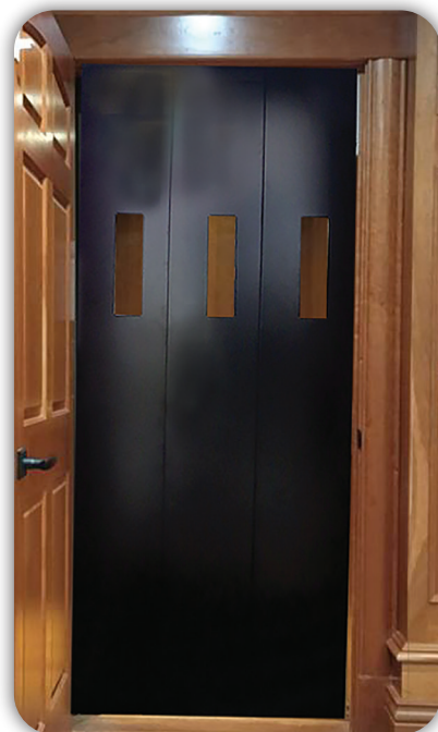
Symmetry Safety 3-Panel Door with Clear vision panels