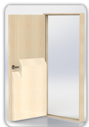
Wood space guard at half height