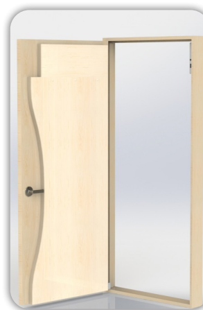
Wood space guard at full height