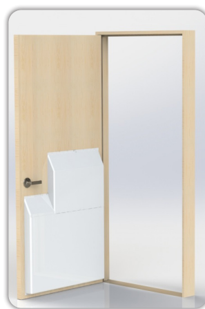
Plastic space guard at 36"