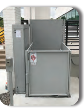
Enclosure Lift Plexiglass Enclosure Lift